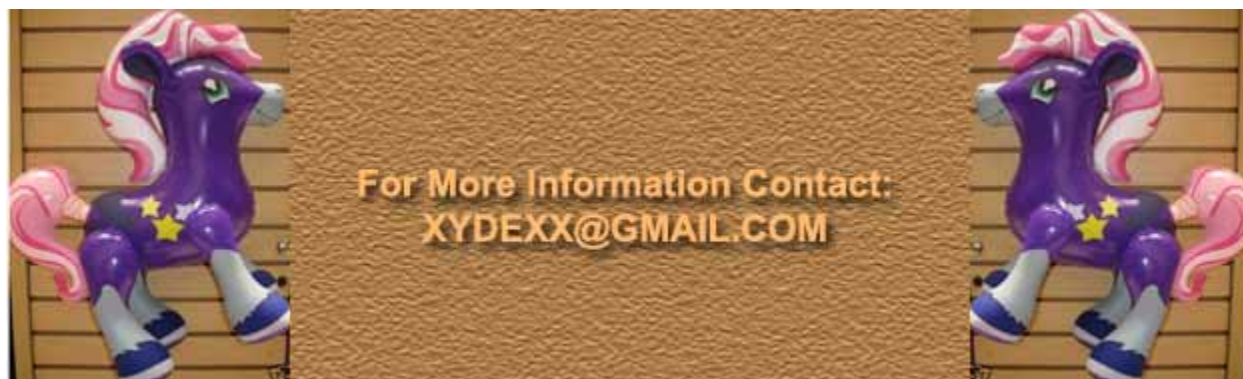
Exhibit 2. Contact Information. Ignore everything except the e-mail address in this diagram.

Individuals wishing to appeal the decisions of the Department of Cute and Weird or be reconsidered should follow the Instructions For Unapproachable Service, Section 2.3, and additionally submit a completed Asshat Request For Reconsideration Form (Appendix A) via electronic mail to the address listed in Exhibit 2.