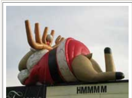
Who could have stolen this gigantic inflatable reindeer?