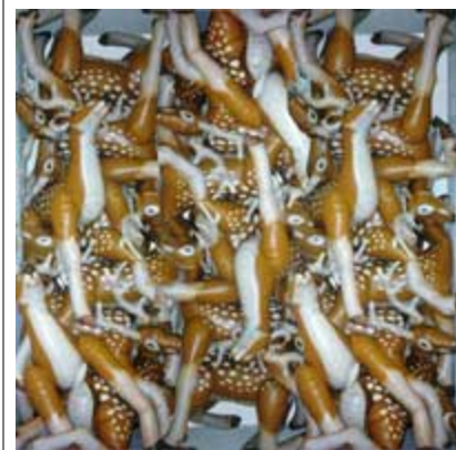
We have our suspicions!