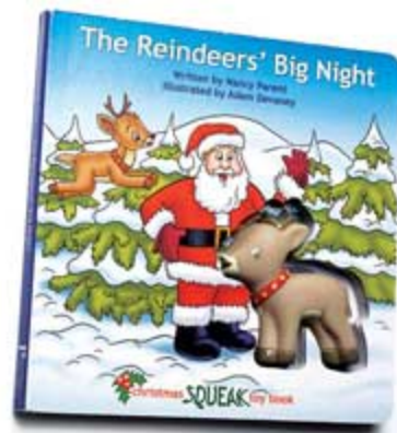
And what were they going to do with it?